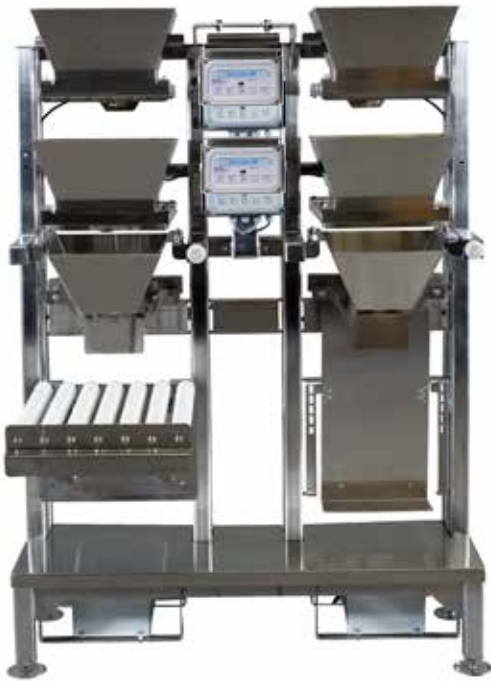
Bagging Scale with Bulk Option